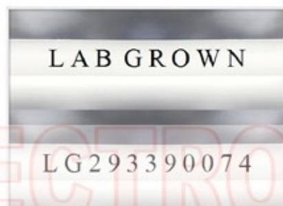
Girdle laser inscribed "LAB GROWN" and "LG293390074"

*Comments: This man-made diamond was grown in a laboratory by the HPHT method, and has the same chemical, physical, and optical properties as a natural earth mined diamond.