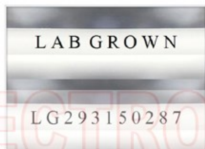
Girdle laser inscribed "LAB GROWN" and "LG293150287"

*Comments: This man-made diamond was grown in a laboratory by the HPHT method, and has the same chemical, physical, and optical properties as a natural earth mined diamond.