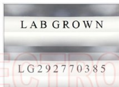
Girdle laser inscribed "LAB GROWN" and "LG292770385"

*Comments: This man-made diamond was grown in a laboratory by the CVD method, and has the same chemical, physical, and optical properties as a natural earth mined diamond. This lab grown diamond is classified as Type IIa, which is the most chemically pure type of diamond, and almost or entirely devoid of impurities. Only 1-2% of natural earth mined diamonds are Type IIa, whereas, colorless and near-colorless CVD lab grown diamonds are usually Type IIa.