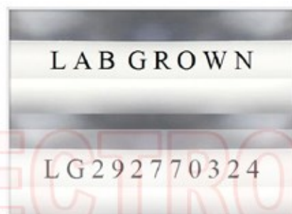
Girdle laser inscribed "LAB GROWN" and "LG292770324"

*Comments: This man-made diamond was grown in a laboratory by the HPHT method, and has the same chemical, physical, and optical properties as a natural earth mined diamond.