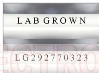
Girdle laser inscribed "LAB GROWN" and "LG292770323"

*Comments: This man-made diamond was grown in a laboratory by the HPHT method, and has the same chemical, physical, and optical properties as a natural earth mined diamond.