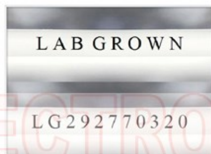
Girdle laser inscribed "LAB GROWN" and "LG292770320"

*Comments: This man-made diamond was grown in a laboratory by the HPHT method, and has the same chemical, physical, and optical properties as a natural earth mined diamond.