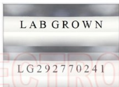
Girdle laser inscribed "LAB GROWN" and "LG292770241"

*Comments: This man-made diamond was grown in a laboratory by the HPHT method, and has the same chemical, physical, and optical properties as a natural earth mined diamond.