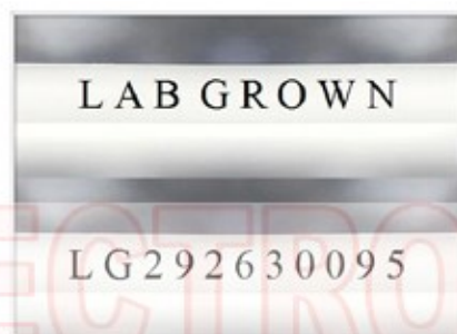
Girdle laser inscribed "LAB GROWN" and "LG292630095"

*Comments: This man-made diamond was grown in a laboratory by the HPHT method, and has the same chemical, physical, and optical properties as a natural earth mined diamond.