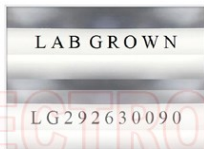
Girdle laser inscribed "LAB GROWN" and "LG292630090"

*Comments: This man-made diamond was grown in a laboratory by the HPHT method, and has the same chemical, physical, and optical properties as a natural earth mined diamond.