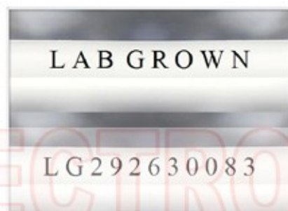
Girdle laser inscribed "LAB GROWN" and "LG292630083"

*Comments: This man-made diamond was grown in a laboratory by the HPHT method, and has the same chemical, physical, and optical properties as a natural earth mined diamond.