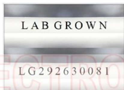
Girdle laser inscribed "LAB GROWN" and "LG292630081"

*Comments: This man-made diamond was grown in a laboratory by the HPHT method, and has the same chemical, physical, and optical properties as a natural earth mined diamond.