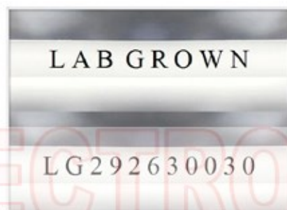
Girdle laser inscribed "LAB GROWN" and "LG292630030"

*Comments: This man-made diamond was grown in a laboratory by the HPHT method, and has the same chemical, physical, and optical properties as a natural earth mined diamond.