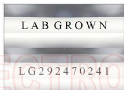
Girdle laser inscribed "LAB GROWN" and "LG292470241"

*Comments: This man-made diamond was grown in a laboratory by the HPHT method, and has the same chemical, physical, and optical properties as a natural earth mined diamond.