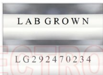
Girdle laser inscribed "LAB GROWN" and "LG292470234"

*Comments: This man-made diamond was grown in a laboratory by the HPHT method, and has the same chemical, physical, and optical properties as a natural earth mined diamond.