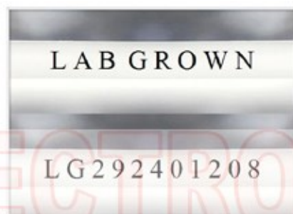
Girdle laser inscribed "LAB GROWN" and "LG292401208"

*Comments: This man-made diamond was grown in a laboratory by the HPHT method, and has the same chemical, physical, and optical properties as a natural earth mined diamond.